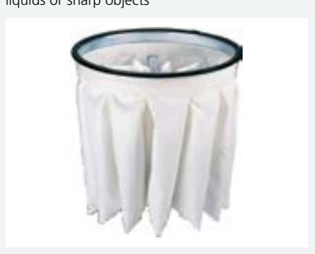
Standard star filter