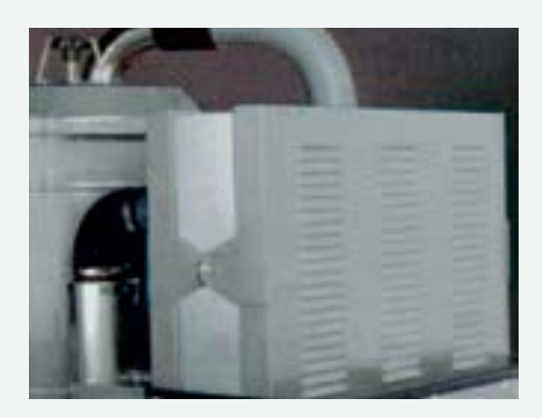
Absolute exhaust air filter