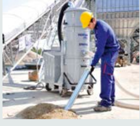
Recovery of high quantity of heavy materials