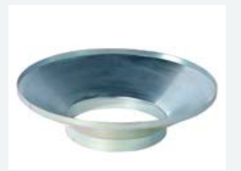
Removable cyclone that protects the primary filter from becoming in direct contact with incoming liquids or sharp objects