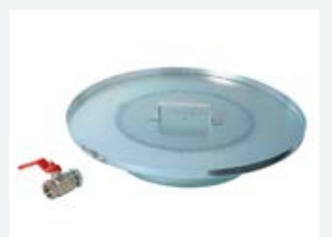
Grill and valve for separating solids from liquids inside the container