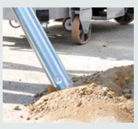
Recovery of waste